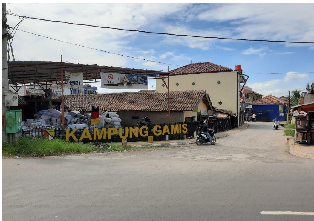
Figure 2. The geographical and recent condition of kampung Gamis

Kampung Gamis is located in Kramat Mulya Village, Soreang sub-District, Bandung Regency. This visual depiction from Kampung Gamis shows that conditions are still not optimal, as seen from the packaging of the Kramat Mulya Village.