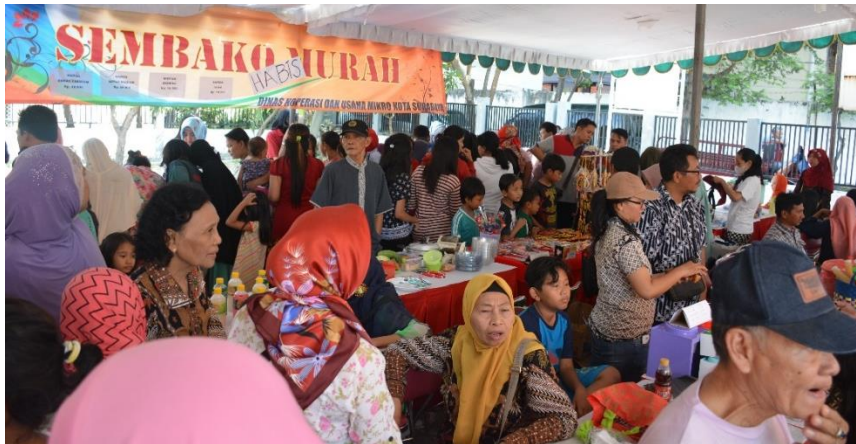
Picture 2. Ramadhan Bazaar in Kenjeran, Surabaya

register their businesses at the Department of Cooperatives and Micro Enterprises for free, to be included in the Ramadhan Bazaar. This bazaar is held every Ramadan, and is held 2x in each subdistrict in Surabaya City.