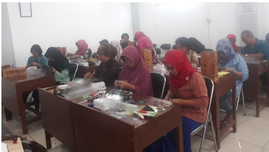
Picture. 1 handicraft training by Surabaya City Industry and Trade Office and Association of SMEs

Department of Trade of Surabaya City expands the marketing reach of products from Micro, Small and Medium Enterprises (SMEs) in Surabaya by promoting it to developing mini-markets (Alfamart, Indomart, sakinahmart, etc.). In addition to helping market SMEs products, Surabaya City Trade Office provides training, for example providing financial management training with Bank Indonesia, then providing training to design their products in an attractive manner with students of the Product Design Department from the Ten November Institute of Technology Surabaya, in addition to the Trade Office Surabaya City facilitated the training of tart cake design with Bogasari. For SMEs marketing, further publications will also be held on major radios in Surabaya, for example Gen FM, Radar Surabaya, Sindo Radio, Muslim Voice Radio, etc.